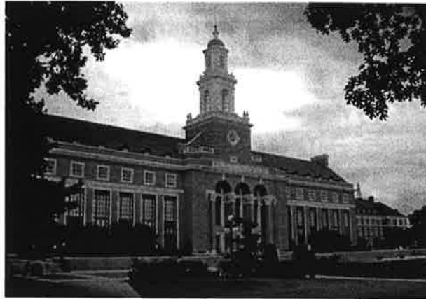
Oklahoma State University