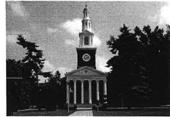
University of Kentucky