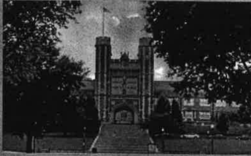
Washington University in St. Louis