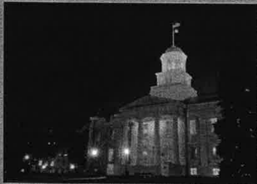
University of Iowa

Historically, about one-third of eligible applicants are awarded scholarships.