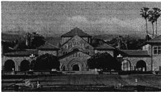
Stanford University, CA